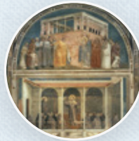
Scenes from the life of St. Francis Santa Croce, Firenze