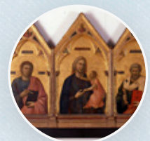
Badia Polyptych Uffizi Gallery, Firenze

“EVERY PAINTING IS A VOYAGE INTO A SACRED HARBOUR.”