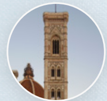
Giotto's Bell Tower Piazza Duomo, Firenze